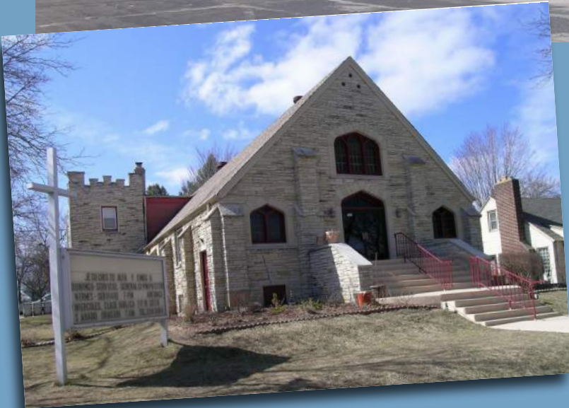
Today's neighborhood- Iglesia Jesucristo Alfa y Omega