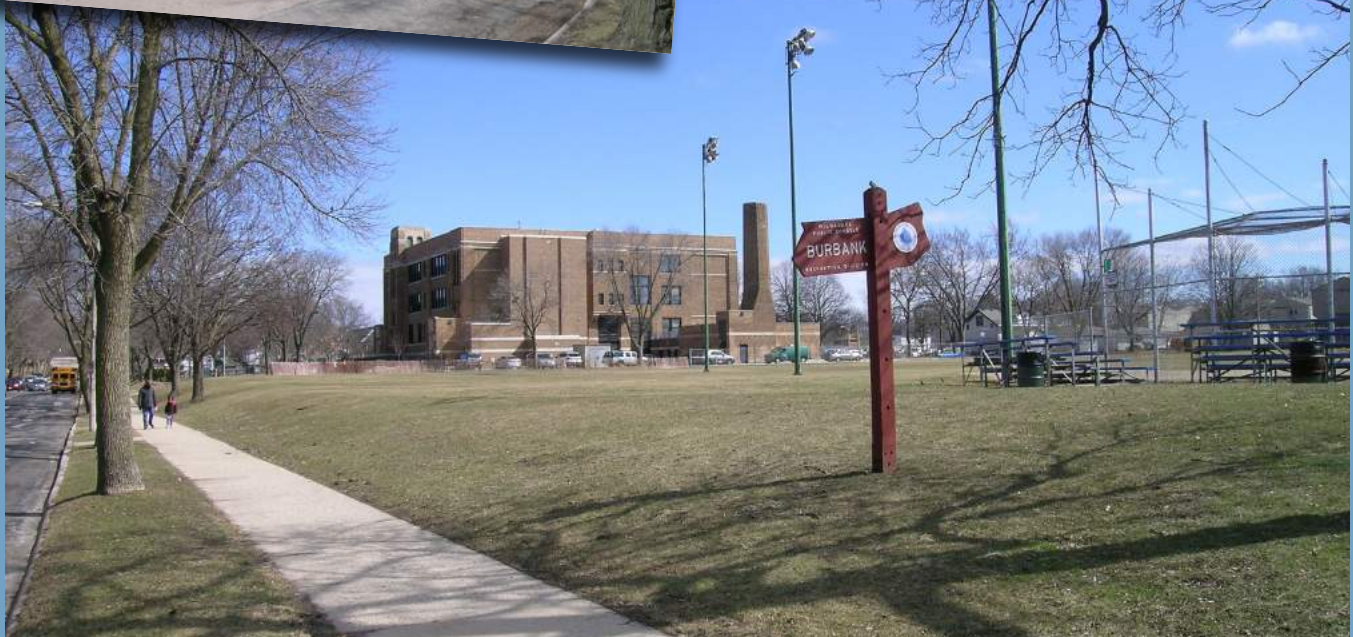
Today's neighborhood-Burbank Elementary School