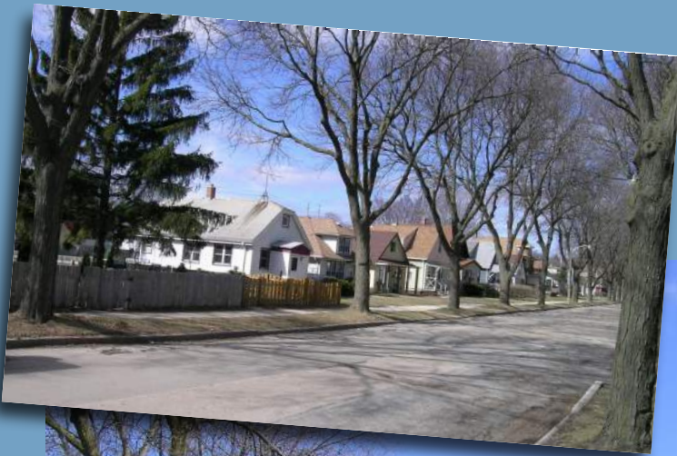
Today's neighborhood- Houses on 60th & Adler